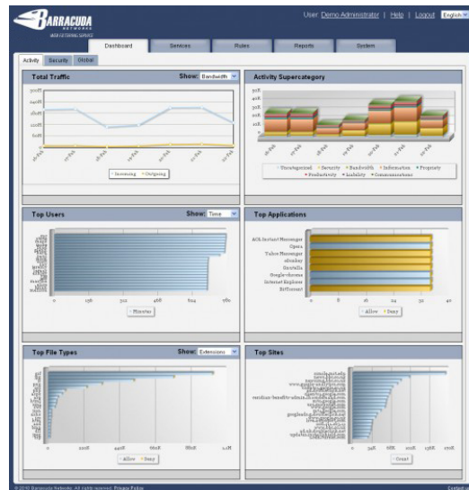
The Activity Dashboard provides a detailed snapshot of the Web activity across all the users in the organization.

The service enforces compliance across all users with centralized control of Web usage and global visibility of real-time, consolidated reporting. The URL database is enhanced with immediate reputation scoring and content analysis. In addition, the Barracuda Web Filtering Service offers content filtering based on file or content type as part of its data leak prevention capabilities. The service also provides application and bandwidth control to manage access to various Web applications, including non-browser based programs such as instant messaging, VoIP, P2P file sharing and streaming media applications.