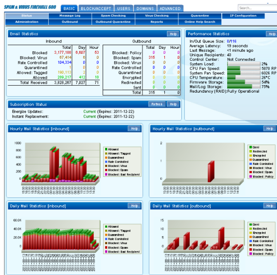
The Barracuda Spam & Virus Firewall filters all email messages and displays the number of emails received with statistics on how they were processed.

The Barracuda Spam & Virus Firewall is easy to set up with no software to install or network modifications required – minimizing ongoing administration. Energize Updates are delivered automatically by Barracuda Central, an advanced technology center where engineers work continuously to provide the latest spam definitions, virus definitions, and security updates which are distributed hourly for continuous protection against the latest threats.